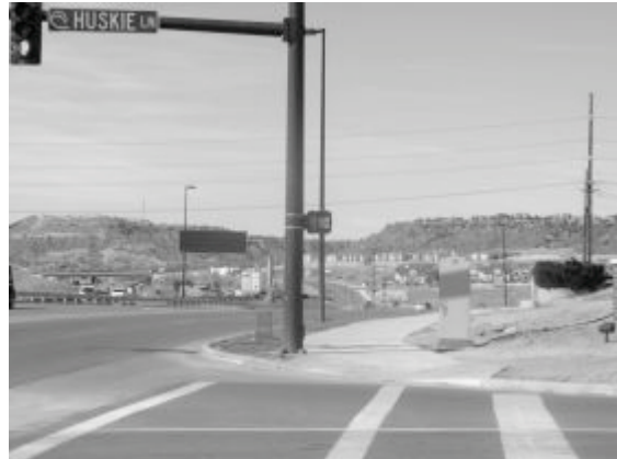
Three quarters of the pedestrians killed in road accidents are hit outside of crosswalks because drivers do not expect them there.

This subject isn't as simple and straightforward as it may sound. At intersections where there is no pedestrian signal, pedestrians should cross in conjunction with the traffic signals. In other words, cross when the facing light turns green, being sure to watch out for cars running red lights or making turns into your path. Keep an extra sharp eye over your shoulder for cars turning right.